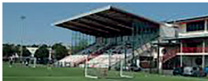
Springfield Stadium, St Helier, Jersey, Channel Islands

Jersey Airport is about 10 minutes St Helier and the ferry docks close to the centre of St Helier.